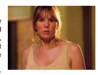
BORGMAN Festival Participation/Awards:

Athens IFF Cannes IFF Haifa IFF Moscow IFF Motovun FF Saraievo FF Svdnev FF Taipei FF Toronto IFF