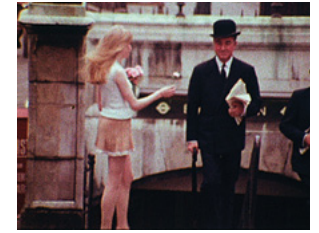
LONDON - THE MODERN BABYLON

LONDON - THE MODERN BABYLON is my personal take on London's journey through the last 100 years to make it the city it is now. No one knows what London will be tomorrow. The city's future is unpredictable. This film celebrates its multi-cultural present as the first truly global metropolis in history.